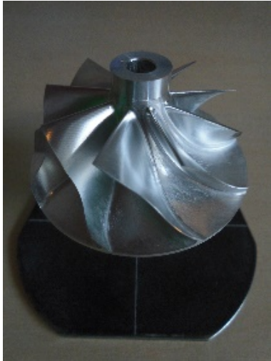
Fig. 1: without ReflexEx